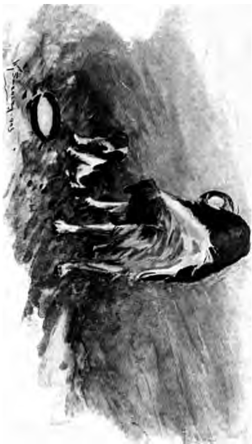
"BY-AND-BY CAME MY LITTLE PUPPY"