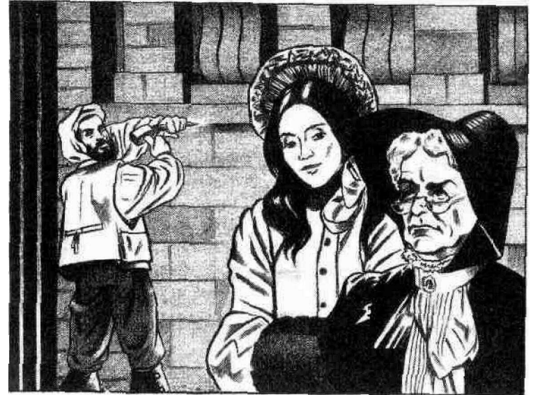
Jude saw Sue next at the 'high' Church of St Silas in Beersheba. She was led by the elderly lady who employed her.

As the days went by, however, he found himself thinking of Sue more instead of less. Indeed, he was always thinking of her.