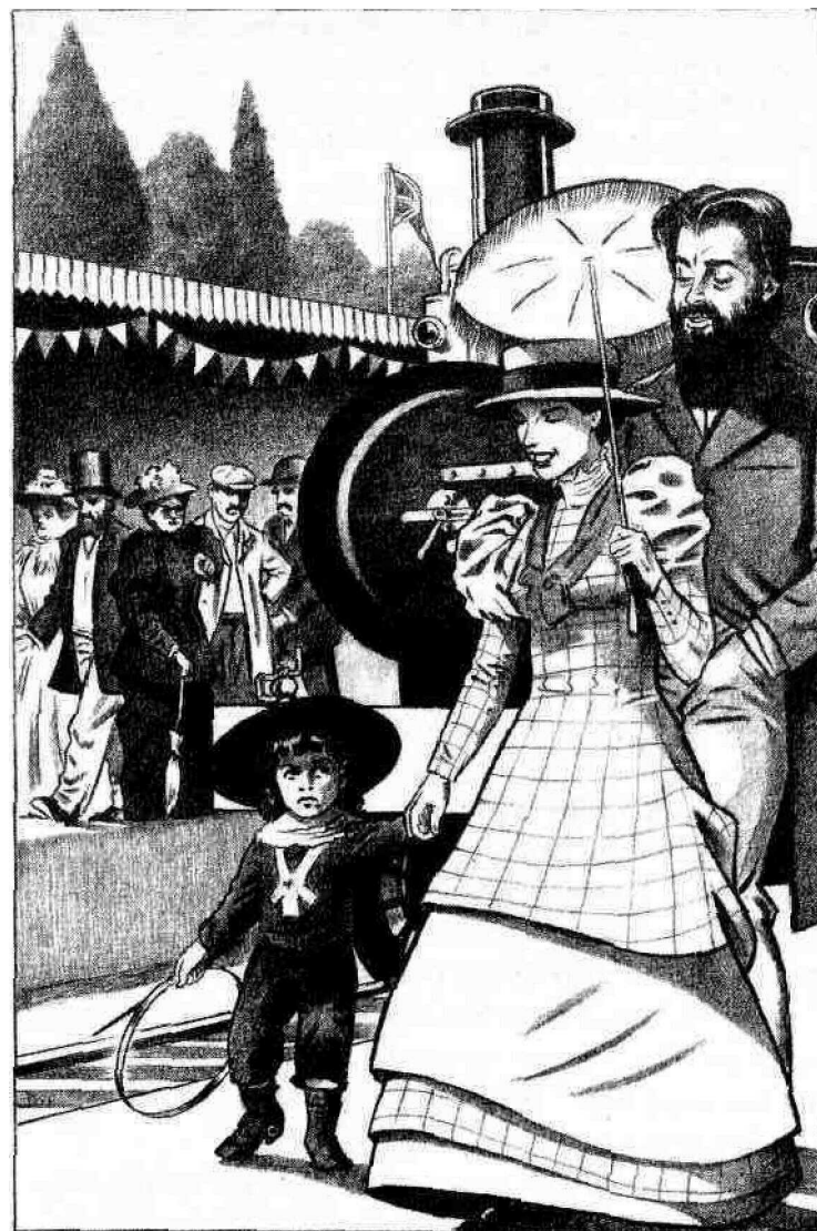
Jude and Sue walked on into the show-ground, enjoying their holiday and trying hard to make Father Time enjoy himself, too.

'Arabella!' She was greeted with a laugh by her girlhood friend Anny, who had come down for the day from Alfredston.