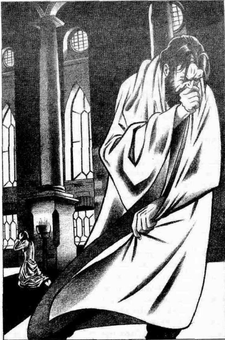
Jude picked up his blanket and went straight out, coughing. Sue hesitated, then put her hands over her ears.

the top of the hill by the Brown House. Here Jude now walked, wet through, against a bitter, north-east wind. It was ten o'clock when he finally reached Christminster.