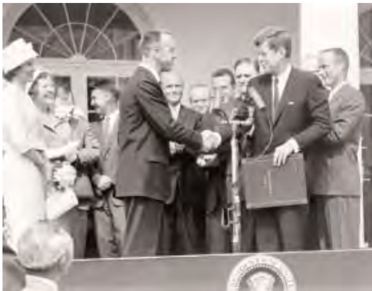
Astronaut Alan B. Shepard receives the NASA Distinguished Service Award from President John F. Kennedy in May 1961, days after his history-making Freedom 7 flight. Shepard's wife and mother are on his left, and the other six Mercury astronauts are in the background.