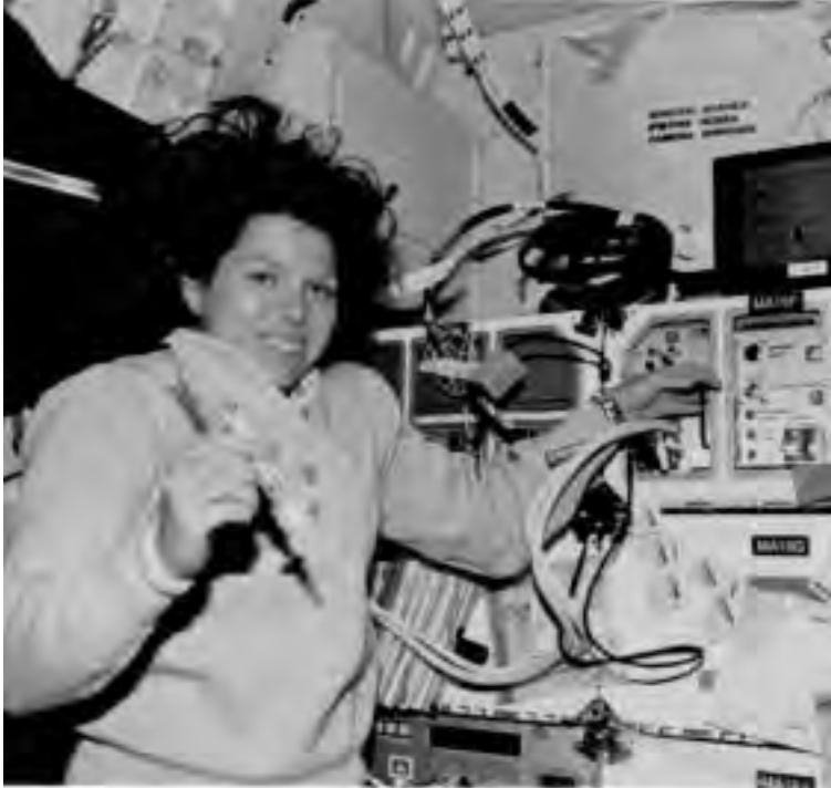
Mary Ellen Weber works with a syringe related to the Bioreactor Development System (BDS) aboard STS-70 in July 1995.