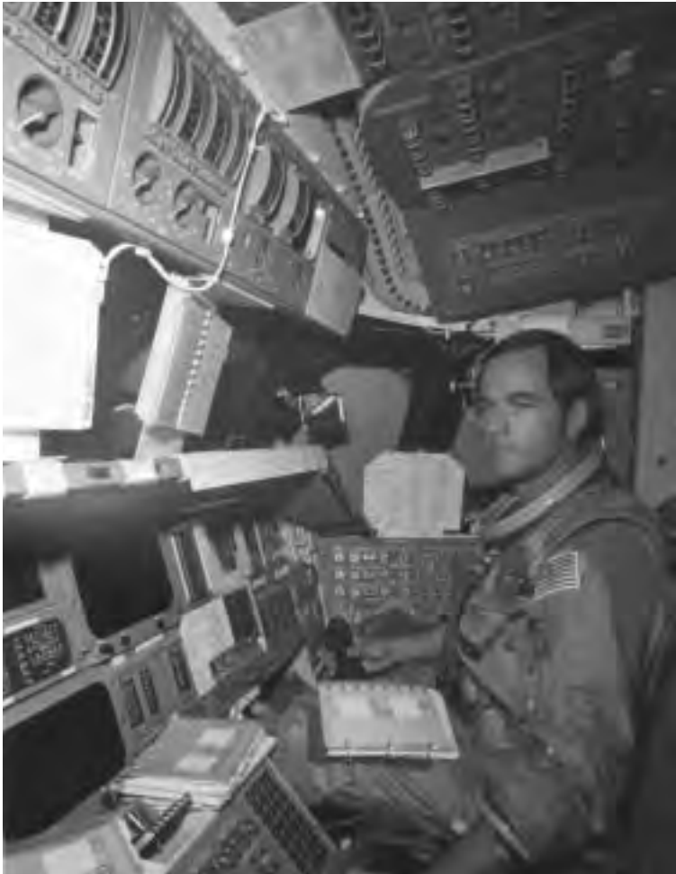
Astronaut Robert Crippen, pilot of the first Space Shuttle mission (STS-1), in the cabin of the Columbia orbiter during a mission simulation on 10 October 1980. NASA Image 80-HC-600.