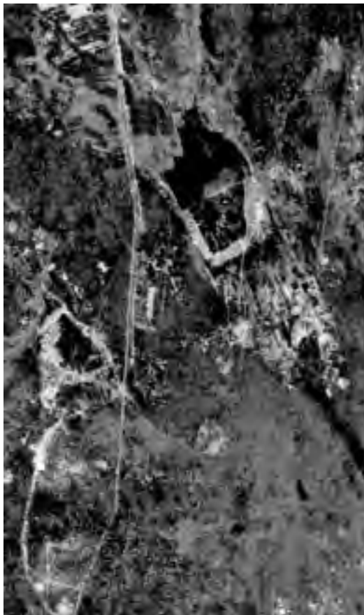
A spaceborne radar image of the Great Wall of China in a desert region about 400 miles west of Beijing. The wall is easily detected from space by radar because its steep, smooth sides provide a prominent surface for reflection of the radar beam. The image was acquired by the Spaceborne Imaging Radar-C/X-Band Synthetic Aperture Radar (SIR-C/X-SAR) aboard the Shuttle Endeavour on 10 April 1994. NASA Image 96-HC-228.