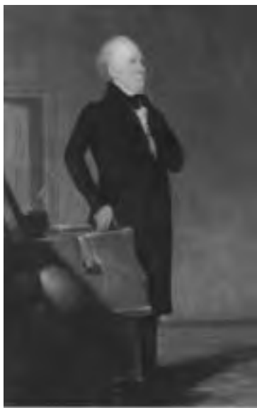
Left: Meriwether Lewis. This 1816 aquatint is by William Strickland. Image NPG.76.22.