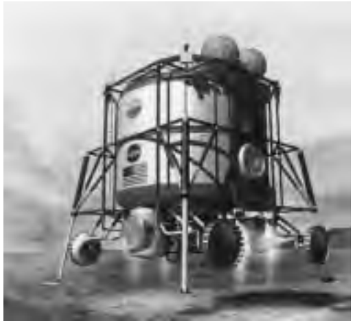
An artist's conception of a vehicle to help humans explore Mars.

There are many problems that face us before humans can actually land on Mars, but there is fundamentally no comparison with our situation forty years ago. We are much better prepared