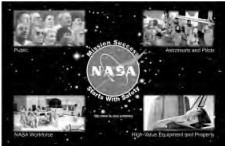
NASA's safety priorities.