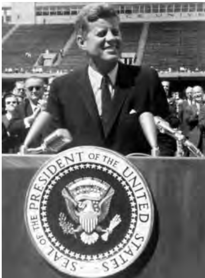
President John F. Kennedy speaks before a crowd of 35,000 people at Rice University on 12 September 1962.