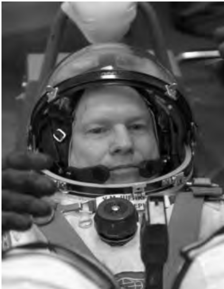
William M. Shepherd, commander of the Expedition 1 crew to the International Space Station, secures his helmet to his Russian Sokol spacesuit during a training exercise on 20 October 2000.