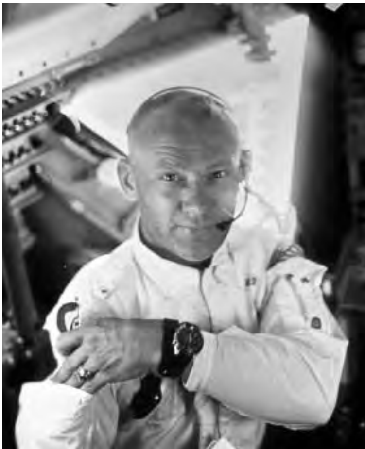
Buzz Aldrin inside the Apollo 11 Lunar Module on 20 July 1969. This image was taken by Neil Armstrong, mission commander, before the two astronauts landed on the Moon. NASA Image 69-HC-893.