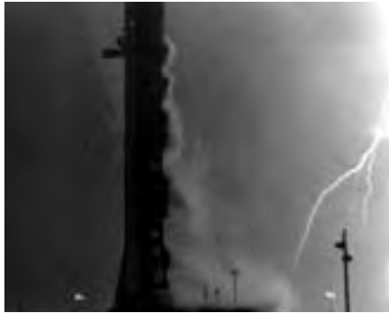
Shortly after liftoff on 14 November 1969, lightning struck the Apollo 12 Saturn V launch vehicle and the launch tower. NASA Image KSC-69PC-812. Special thanks to Kipp Teague for help with this image.

the controllers' screens, but that the data made no sense whatsoever. They didn't know that the spacecraft had been hit by lightning. All the controllers knew was that the platform had been lost; the guidance platform had been lost; that they weren't able to read any of their data; and it was taken for granted that what you had to do at that point was abort.