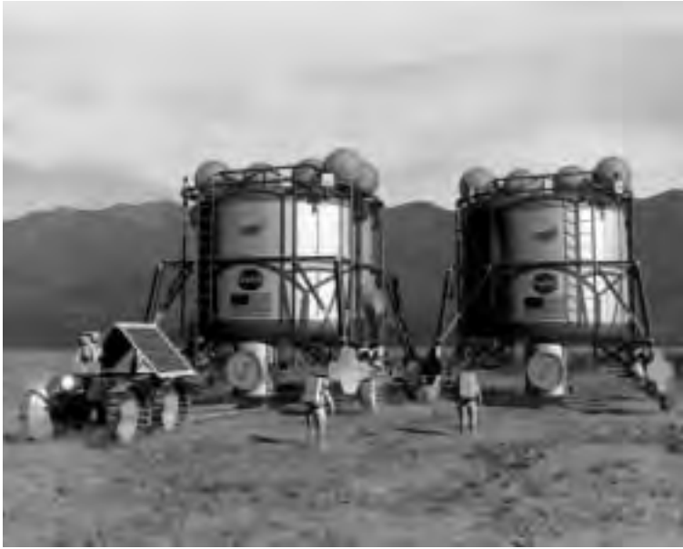
An artist's conception of two habitats that a crew would connect while exploring Mars.