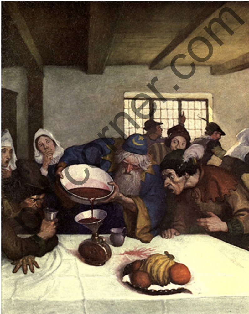
THE ASTROLOGER EMPTIED THE WHOLE OF THE BOWL INTO THE BOTTLE

into the astrologer's body; then the astrologer put up his hand, and apparently in his own voice said, "Wait—remain where you are." All stopped where they stood. "Bring a funnel!" Ursula brought it, trembling and scared, and he stuck it in the bottle and took up the great bowl and began to pour the wine back, the people gazing and dazed with astonishment, for they knew the bottle was already full before he began. He emptied the whole of the bowl into the bottle, then smiled out over the room, chuckled, and said, indifferently: "It is nothing—anybody can do it! With my powers I can even do much more."